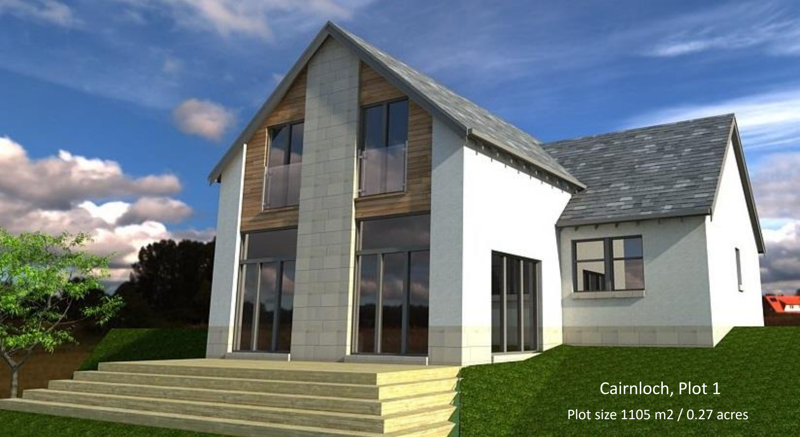
Cairnloch, Plot 1 Plot size 1105 m 2 / 0.27 acres